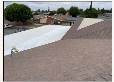
The white paper replaced the old tar paper and rock on top of flat roof.