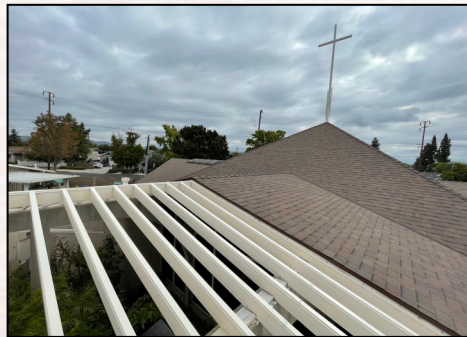
Metal caps on the beams